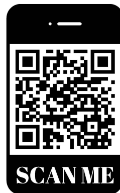
SCAN TO COMPLETE YOUR W-9 FORM