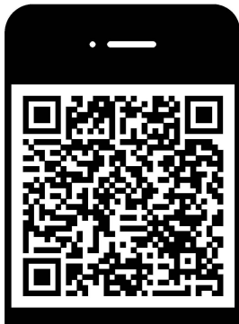
SCAN FOR GREEN/NP DECLARATION FOR CLUB ONLY MEMBERS (NOT NRCHA MEMBERS)